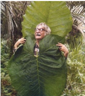
Roberto Burle Marx in jovial mood