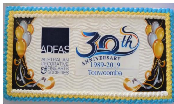
The beautifully decorated cake