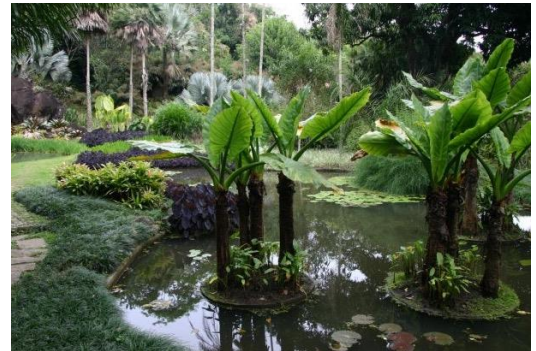
Burle Marx's private garden,

His garden designs broke away from the traditional use of European plants, neat hedges and cottage gardens. Instead he explored how the riot of colour and texture contained in Brazilian plants could be incorporated in private gardens and public spaces.