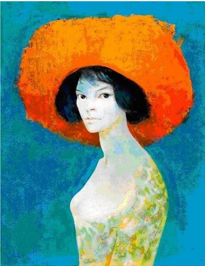
Self Portrait with Red Hat by Leonor Fini (1968)