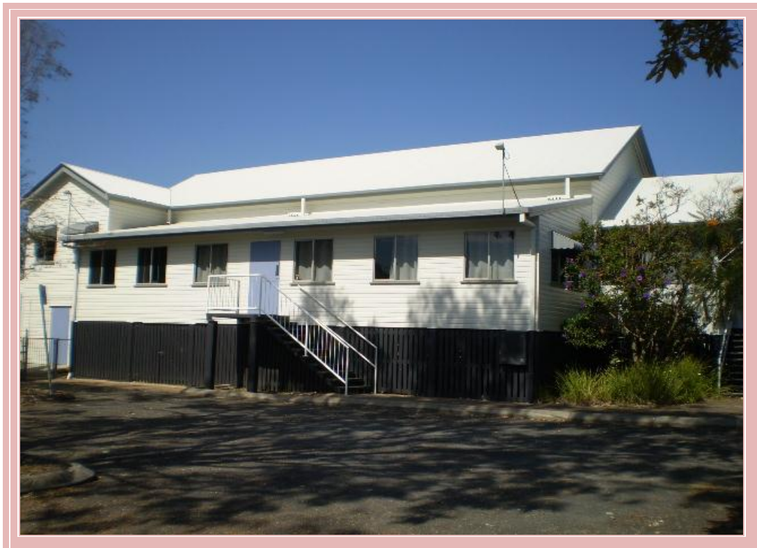
Side view of Birkdale School of Arts Hall

The Courier Mail of 3 rd June, 1942, reported on a concert and dance held which raised £8.1. 6. for the purchase of War Savings Certificates for district men in the fighting forces, with 69 Certificates having been bought for presentation to men from Wellington Point and Birkdale when the war ended. 10